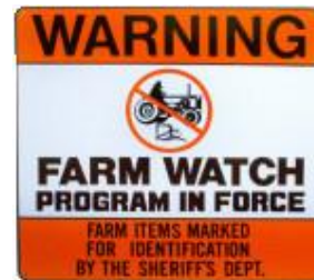
Farm/Ranch Watch Sign

Inventory item Please contact CFBF member help desk at 1-800-698-3276 or your local county Farm Bureau office.