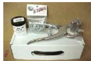
Livestock ear tattoo kit

Walco International 1917 Foundry Ct. Ceres, CA 95307 (209) 538-2750 www.walcointl.com